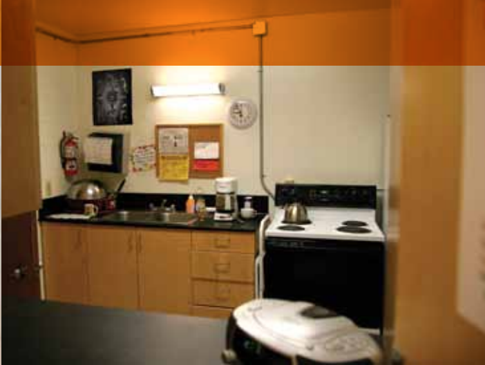
Kitchen before renovation