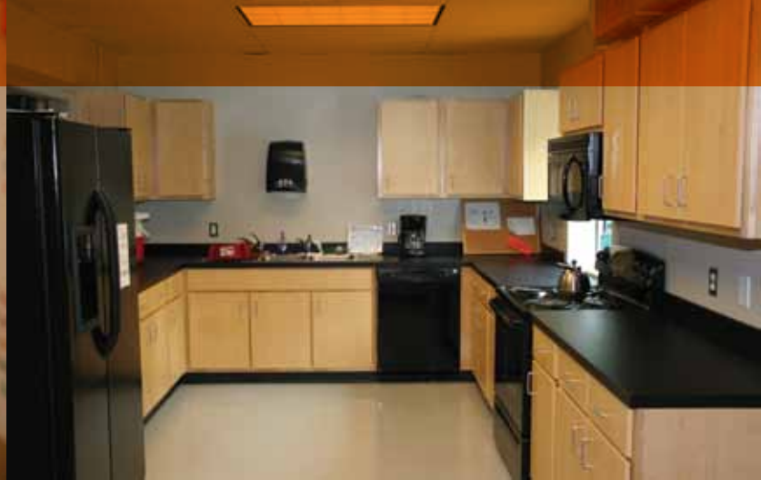
Kitchen doubled in size and received new appliances!